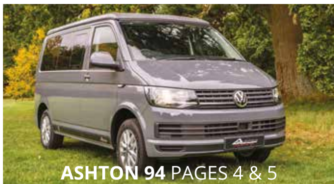
ASHTON 94 PAGES 4 & 5

Our baseline model is one of our newest members of the Autohaus family, paying homage to the first campervans we built back in 1994.