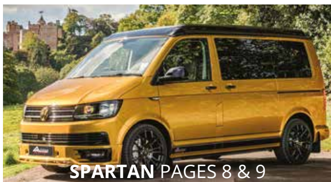
SPARTAN PAGES 8 & 9

Travel in Luxury and style the Ashton is still our most popular campervan the perfect vehicle for all occasions, that short weekend break or a trip to new horizons.