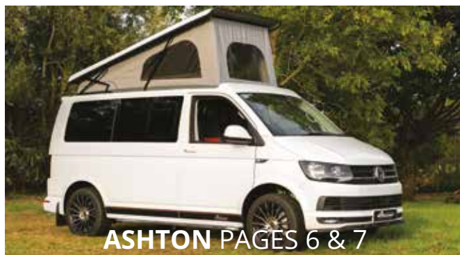
ASHTON PAGES 6 & 7

Our baseline model is one of our newest members of the Autohaus family, paying homage to the first campervans we built back in 1994.