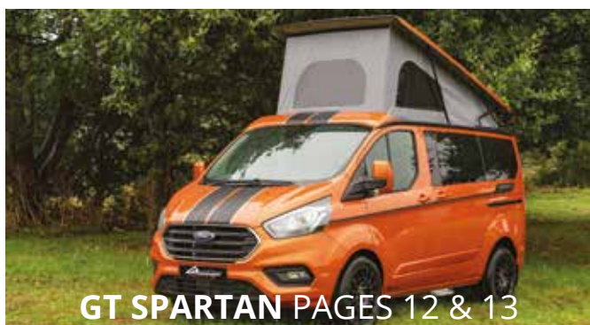
GT SPARTAN PAGES 12 & 13

The Camelot now comes with rear elevator or fixed Hi-Top, its perfect for camping off the beaten track with its neat rear bathroom facilities you always feel at home.