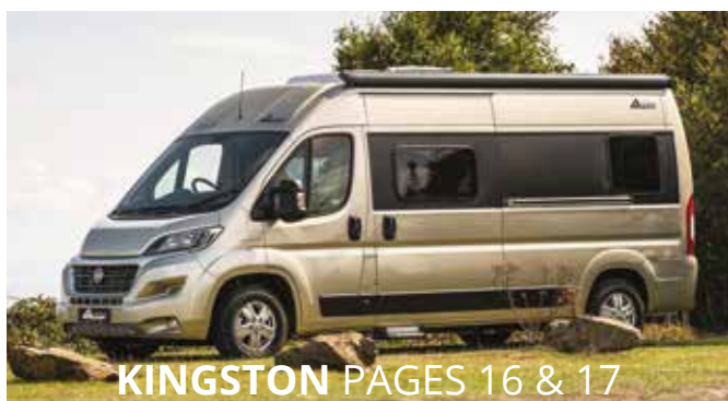
KINGSTON PAGES 16 & 17

The Camelot now comes with rear elevator or fixed Hi-Top, its perfect for camping off the beaten track with its neat rear bathroom facilities you always feel at home.