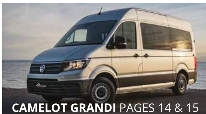
CAMELOT GRANDI PAGES 14 & 15

This is our First Campervan built on the all new Ford Transit Custom, the GT Spartan is great value, has 5 traveling seats all the luxury and style at a great price.